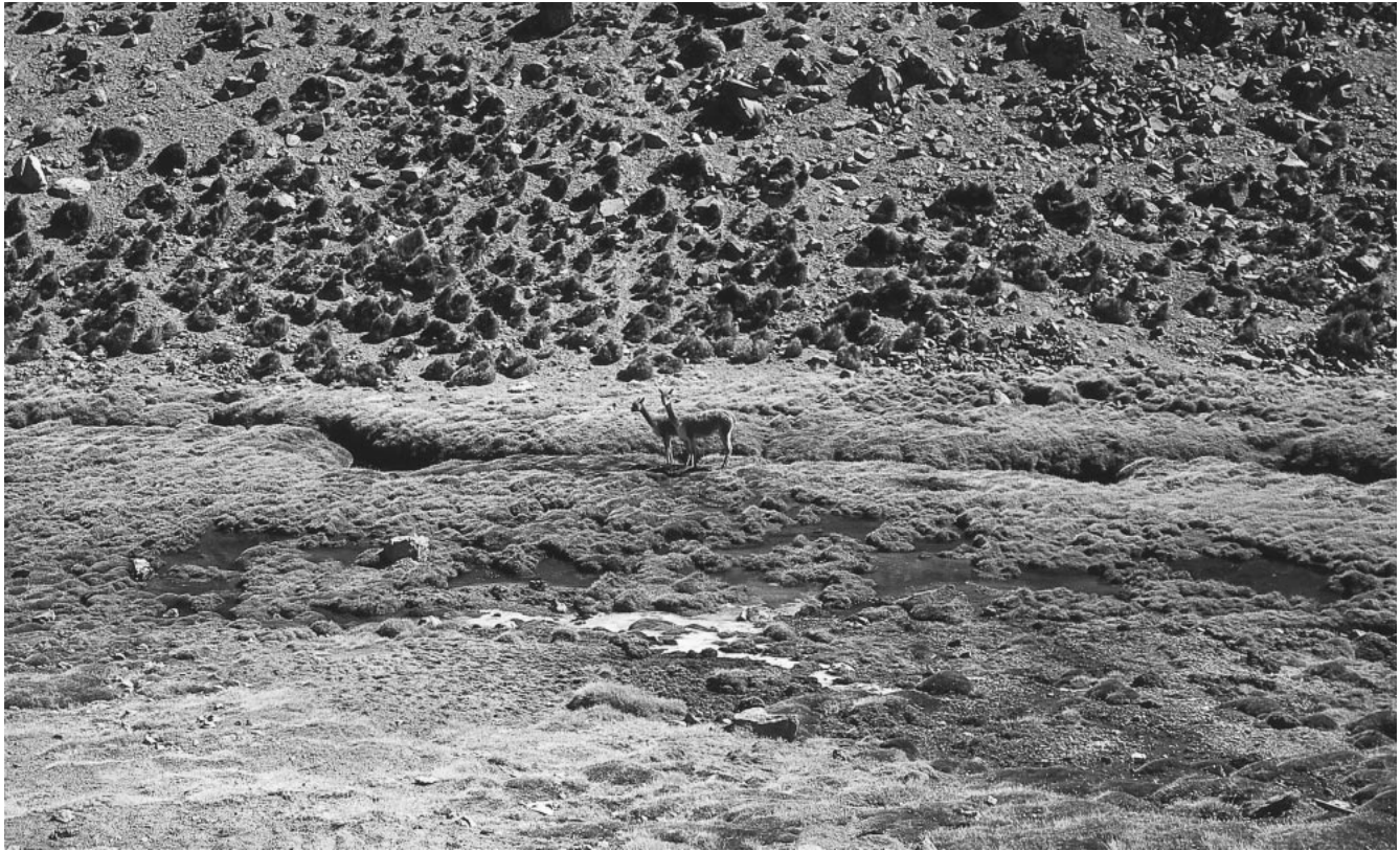
FIGURE 4 Grazing vicuñas on one of the roadside bofedales near Las Cuevas in Lauca National Park. The rocky hillside slopes behind are dominated by perennial bunchgrasses, particularly Festuca orthophylla and Deyeuxia breviaristata .