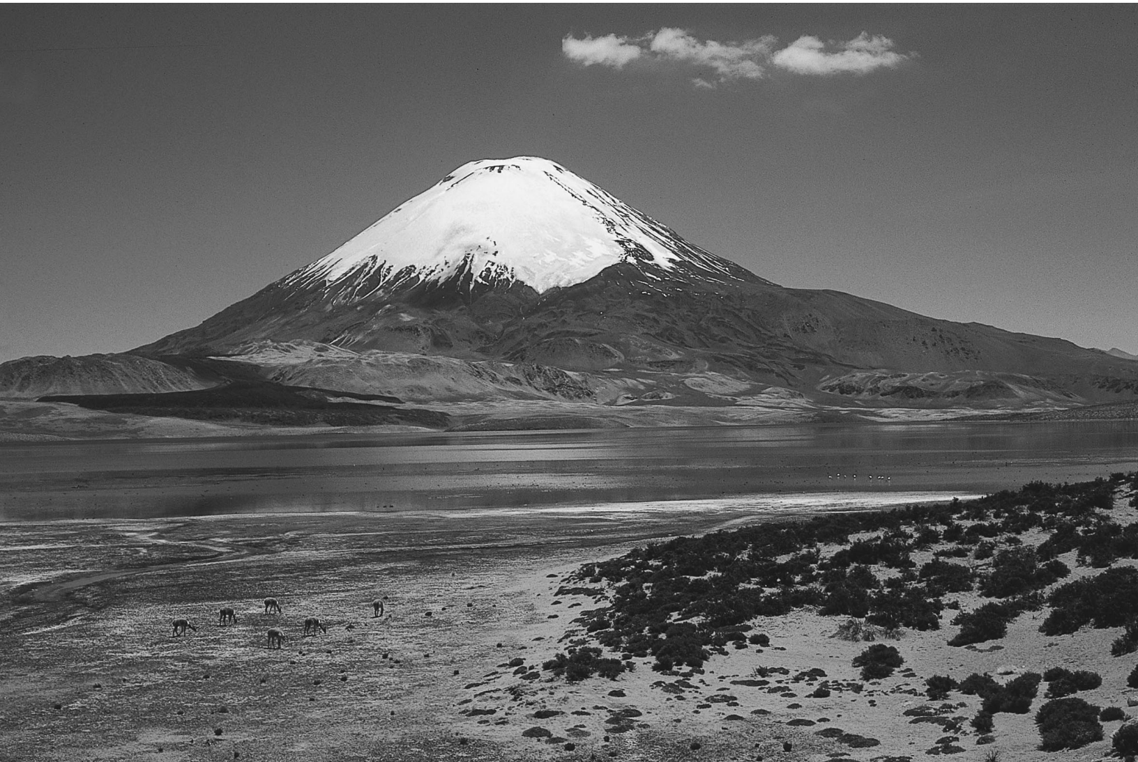
FIGURE 2 Volcán Parinacota (6342 m) with Lago Chungará, the highest elevation lake in the world, at its base. In the right foreground are dwarf woodlands dominated by Polylepis tarapacana , and the left foreground shows wetland habitats termed bofedales with grazing vicuñas.

The relatively gentle topography within the Lauca Basin averages about 4100 m in altitude, giving it an elevation about 500 m higher than Lago Titicaca. Geological evidence and climate indicators such as pollen, evaporites, and sedimentary facies indicate that an arid climate has existed in the Lauca Basin over the past 6.2 million years (Kött et al 1995; Gaupp et al 1999).