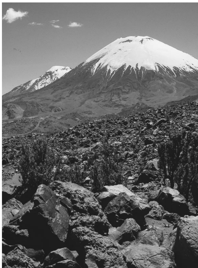
FIGURE 3 Volcán Ponerape (6240 m, left) and Volcán Parinacota (6342 m, right) tower over rocky lava ridges with stands of Polylepis tarapacana growing with Parastrephia lucida and Azorella compacta .

The biogeographic affinities represented in the flora of Lauca National Park and adjacent areas of Parinacota Province show differing patterns between zonal and wetland floras. The flora of zonal habitats of the prepuna and puna show stronger floristic links to a regional puna flora extending from southern Peru and western Bolivia into northern Chile and Argentina. This puna flora in the Andean puna habitats of northern Chile is markedly distinct from that of the Andean flora characteristic of the central and south-central Andes, where winter rainfall regimes exist (Arroyo et al 1988). There is a stronger floristic similarity, however, between the puna wetland flora of northern Chile and the Andean wetland flora of central and southern Chile, and little local endemism is present in this group (Arroyo et al 1982, 1988; Ruthsatz 1993).