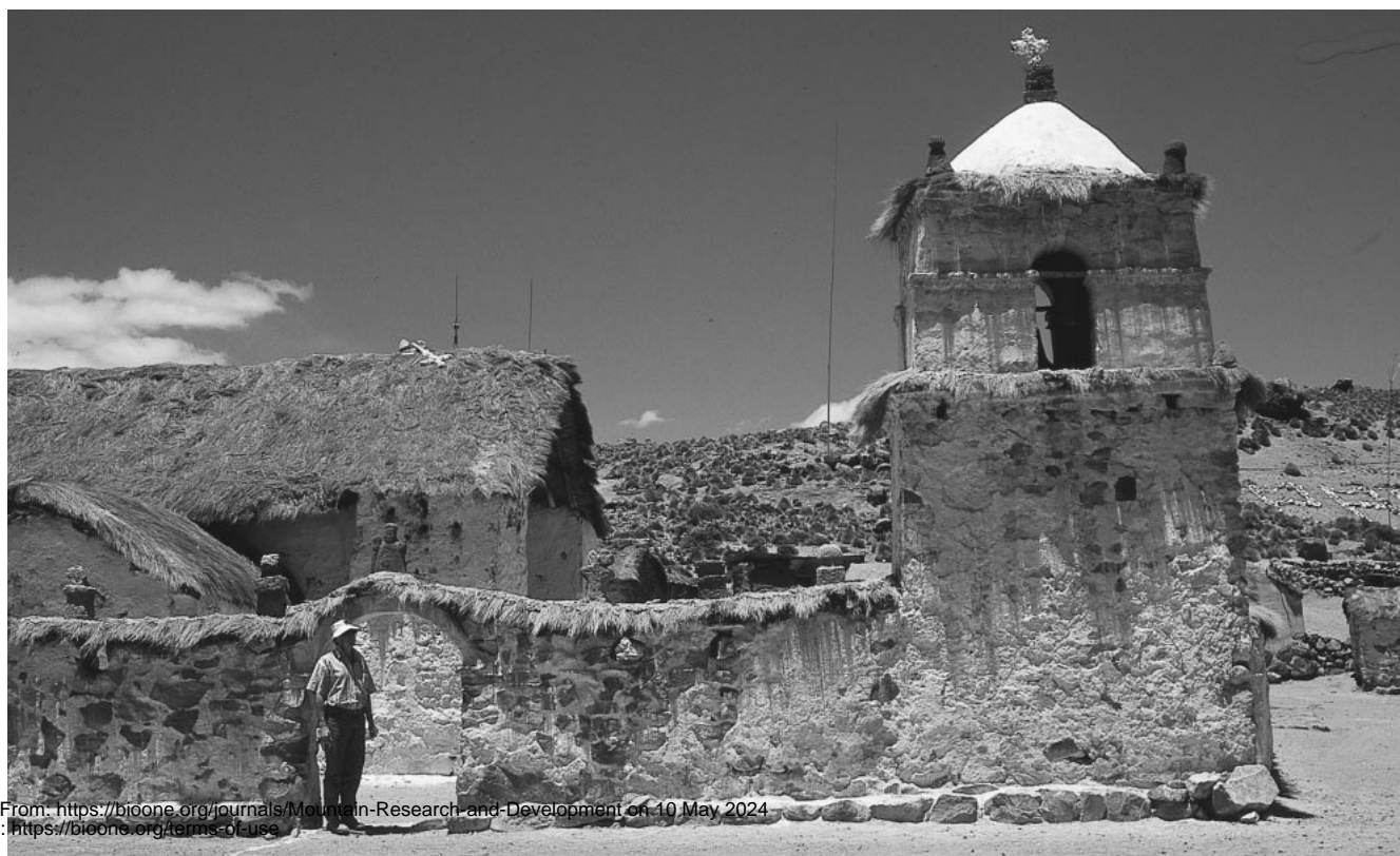
FIGURE 5 Village of Parinacota at 4400 m elevation in Lauca National Park. The church was originally constructed by the Spanish conquistadors in the 17th century, and rebuilt in 1789.

Human history in the Lauca region of Parinacota Province extends back thousands of years. Hunter-gatherers are thought to have inhabited this region at least 7000 years ago and perhaps as far back as 10,000 BP. Agricultural and herding centers began to develop