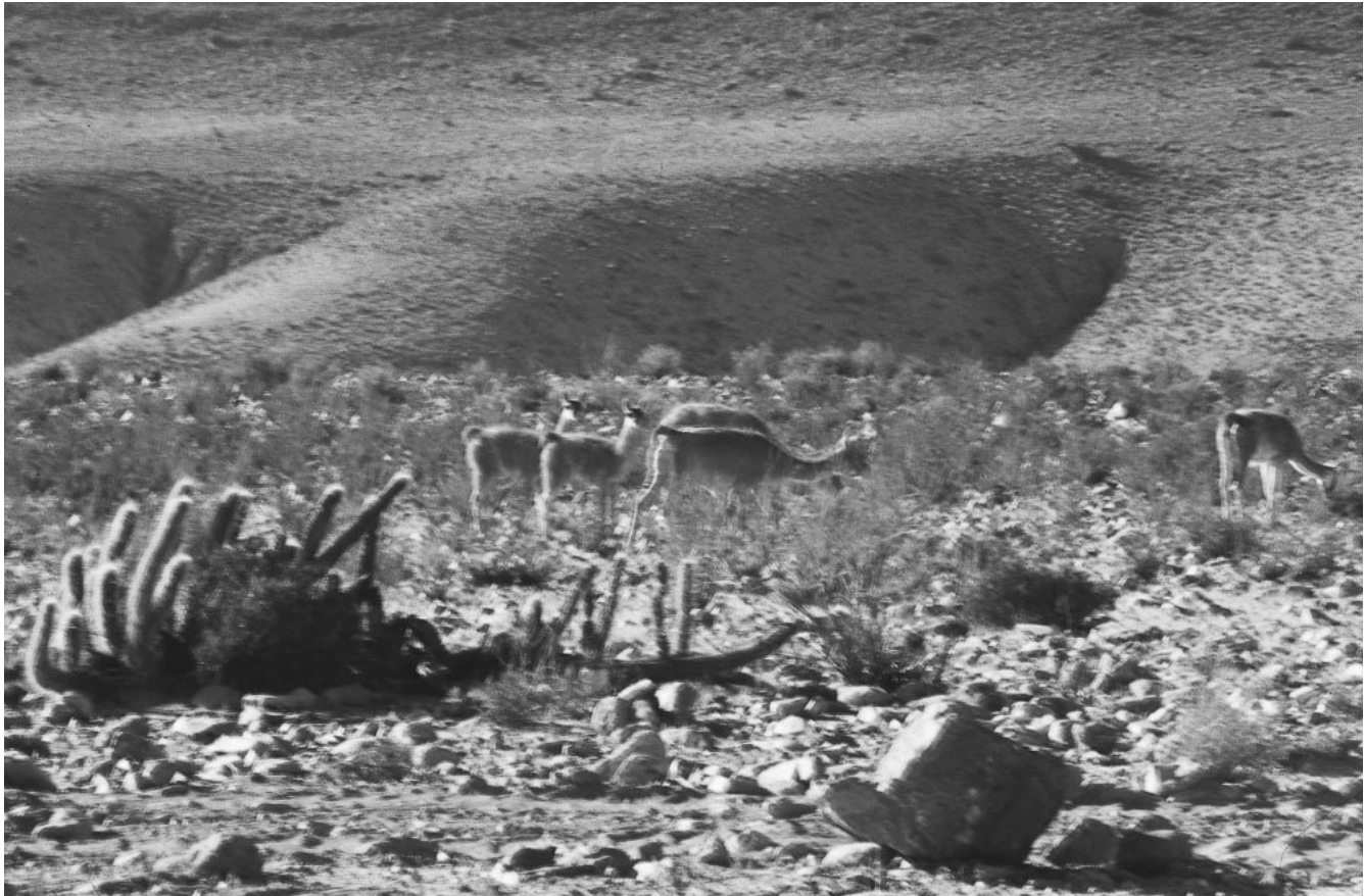
FIGURE 6 Grazing guanacos in pre-puna shrubland about 30 km southwest of Putre, outside of Lauca National Park. This habitat is poorly represented within the park.

leading to the creation of Las Vicuñas National Reserve adjacent to Lauca as an area where more active management can take place. Careful consideration is now being given to how herds of vicunas can be managed so that an industry can be developed by indigenous populations to harvest valuable vicuña fur in a sustainable manner and without violating the restrictions of CITES for this endangered species. Management and protection of Andean huemul, guanacos, and a variety of rare plant species in prepuna habitats can best be implemented by adding larger areas of these habitats to the existing park (Figure 6). This issue is discussed in more detail below.